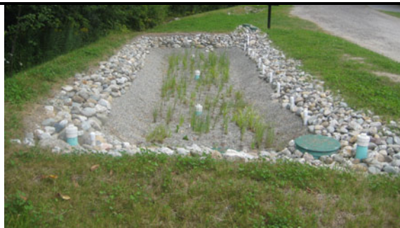
Photo of the gravel wetland after initial planting.